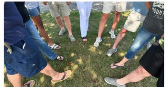
FOOTPRINTS ON CAMPUS Praying for schools in Fayette County