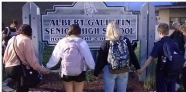
SEE YOU AT THE POLE Albert Gallatin High School